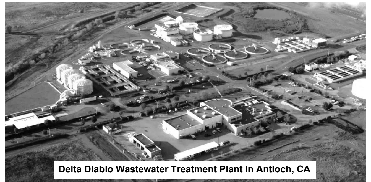
Delta Diablo Wastewater Treatment Plant in Antioch, CA

Written protests may be sent to the District (attention of “Office Manager/Secretary to the Board”, 2500 Pittsburg-Antioch Highway, Antioch, California, 94509) prior to the close of the public hearing and must include your property address and the Assessor Parcel Number found on your mailing label. At the close of the public hearing, the Secretary to the Board will announce the total number of protest responses, including any received by the close of the public hearing. If written protests are presented by a majority of the parcel owners in the District’s service area, the District cannot implement the SSC increases.