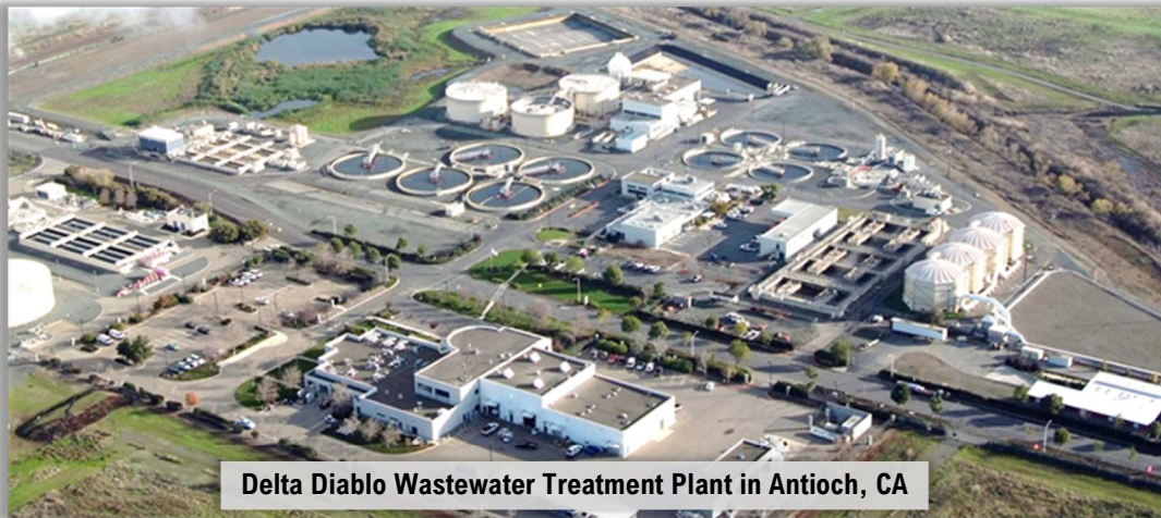
Delta Diablo Wastewater Treatment Plant in Antioch, CA

Delta Diablo (District) has developed a proposed $136 million prioritized 5-year Capital Improvement Program (CIP) to meet critical aging infrastructure needs. This continued investment is essential to protecting public health and the environment and maintaining effective and reliable wastewater collection, conveyance, and treatment services, and recycled water production. The District's Wastewater Treatment Plant (WWTP), which includes a combination of physical, biological, and chemical treatment processes, is 40 years old and requires significant rehabilitation and replacement work to address aging concrete structures, mechanical equipment, and electrical systems. Key CIP highlights include: